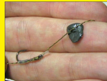
11. To keep the rig line neatly pinned to the bottom, put a piece of tungsten putty on the braid