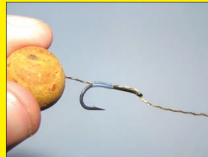
7. Now pull the boilies towards the hook bend until the hair has the ideal length