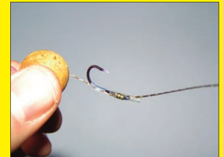
8. Slide a piece of shrink tube over the line and the eye of the hook (if you like, you can add a line aligner effect like shown here)