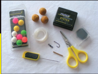
1. MAD® Mystix, Longshank Hook, and shrink tube are essential for this tactical rig