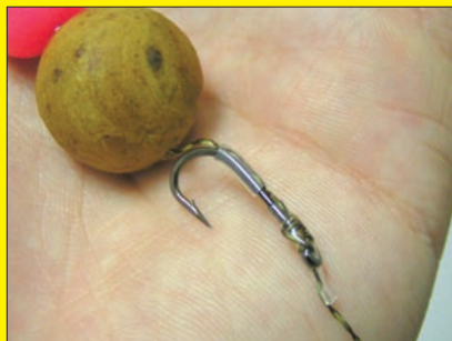
9. Check if the hooking effect of the rig is optimal by sliding off your hand