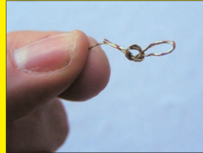
3. Tie a little loop on one end of the braid