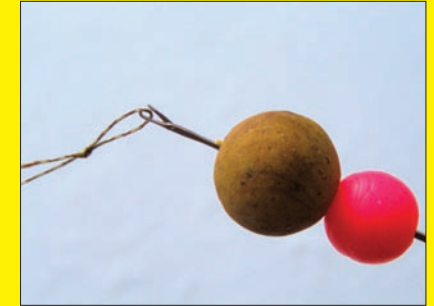
4. To get the optimal hair length, put on the bottom bait and the pop-up on the hair already