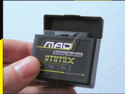
2. Cut a piece of Mystix rig link in the length of your own preference