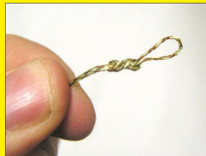
10. Tie a loop knot on the end of the rig to connect to either a quick® change or a normal swivel